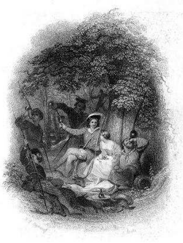
Robin Hood and Maid Marian.