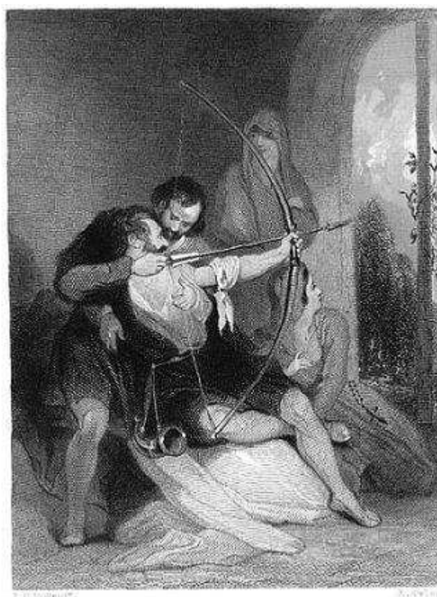
The death of Robin Hood