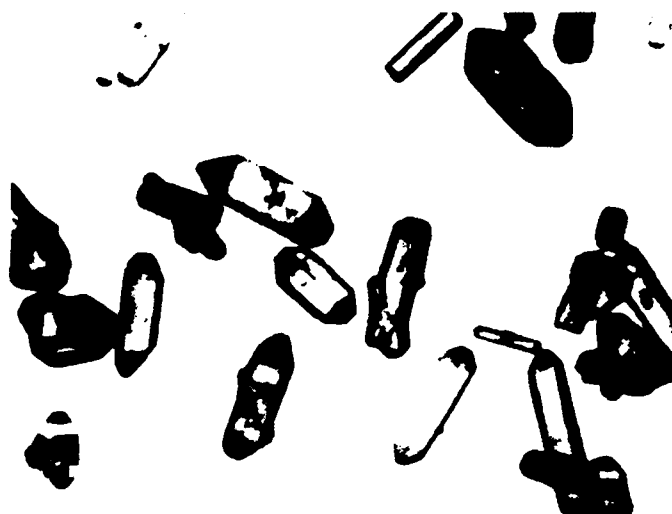
Fig. 1 Photomicrograph of High Density Silver Azide (X140)